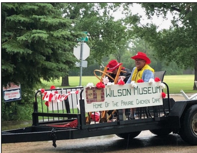
The Wilson Museum float along with a few other parade entries made a round despite the weather