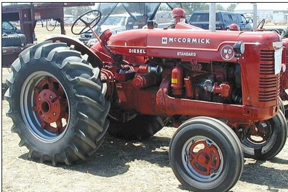
W6 McCormick Tractor finds a new home