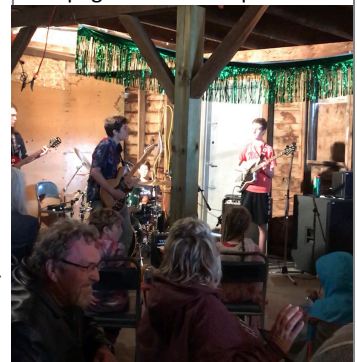
The band BISHOP gets the crowd going

The town wishes to thank all that came out to celebrate and to Heritage Canada and Sask Lotteries for grant funding. See page 16 for more pictures.