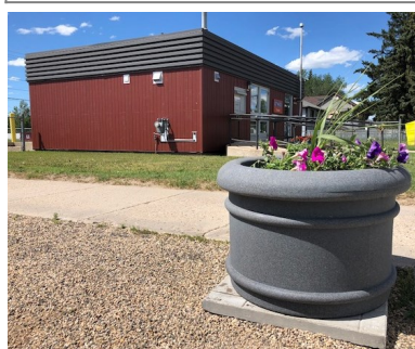
New water saving pots

(continued from page 2) and enhance visitors experience to the town. They were successful in the early years, winning many awards in CIB provincial competitions.